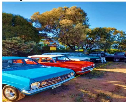
The car club

This group usually meet at the Village on train running days for coffee and a chat about cars. For more information contact Garry Nichols