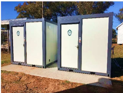
The new shower /toilets

Since the last newsletter, new toilets and showers have been purchased and installed. This involved a new septic system to comply with Council's requirements. Although this has been an expensive investment for the Village, a state government grant (Community Partnerships) considerably softened the cost.