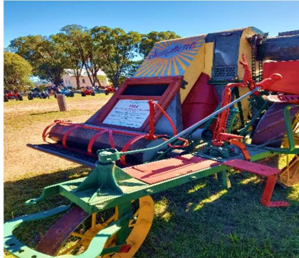
Recent restored header

Following the restoration of a grain harvester for Blacktown Council a few years back, Geoff Ingall assisted by Ian Saunders and John Benham have continued to restore several headers, using the pavilion near the main gate as their workshop. The Village will soon have a collection of restored farm machinery the envy of many museums thanks to these dedicated gents.