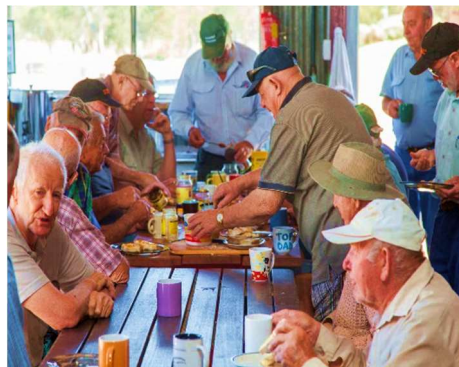
Men's shed morning tea