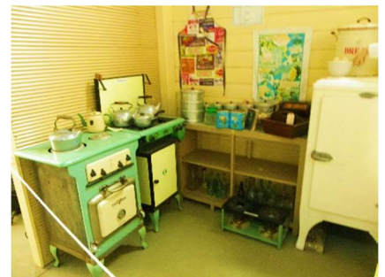
Kitchen 1940's era