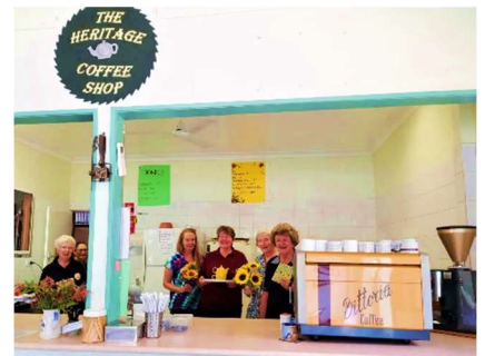
Some of the coffee shop ladies

The shop continues to open each Friday, Saturday and Sunday (currently not the first weekend of each month). It is staffed by a small group of volunteer ladies. New ladies are always welcome to join the roster. If you could spare a day a month to keep the Village open, please call Sue Nichols